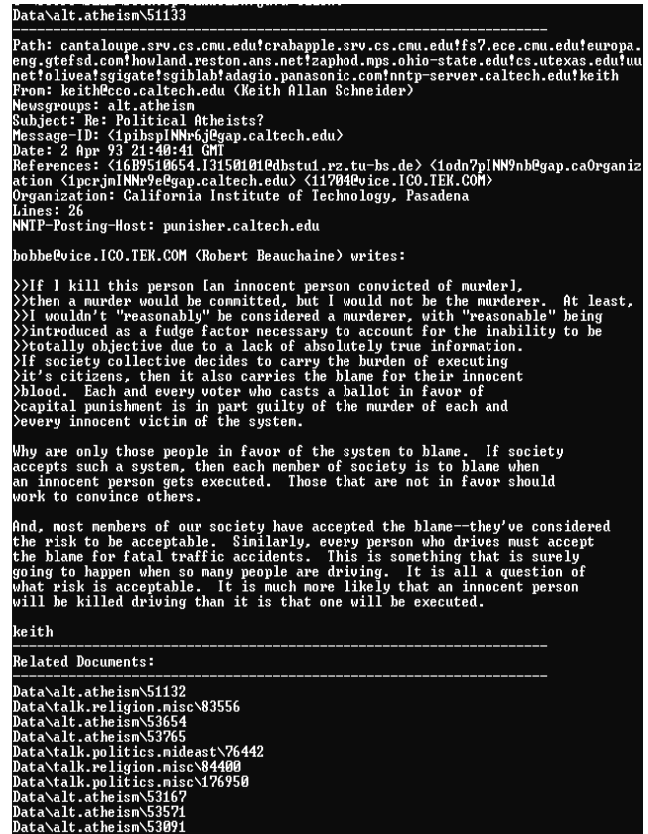
Fig. 3 Snapshot of client selecting file and system recommended files.

Table shows result of proposed algorithm gives recommended files for further reading as user select file to read. Here are two files examples which show effectiveness of proposed algorithm for recommendation system using LDA model. In table first column have file which is user selected and second column show recommended files for currently selected file for user.